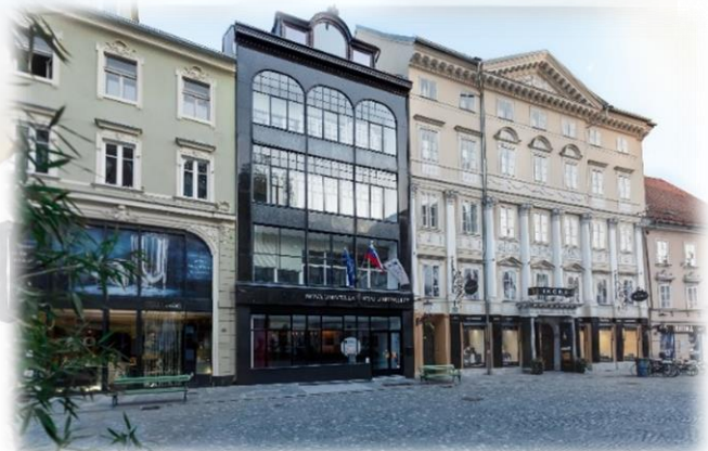
FAKULTETA ZA DRŽAVNE IN EVROPSKE ŠTUDIJE

Ljubljana is the central hub for all Erasmus+ activities , including lectures, seminars, workshops, cultural events, and administrative tasks. By consolidating activities in Ljubljana, participants have access to a wide range of resources and facilities, including state-of-the-art classrooms, libraries, research centers, and student support services. This centralized infrastructure enhances the learning environment and supports academic and personal development.